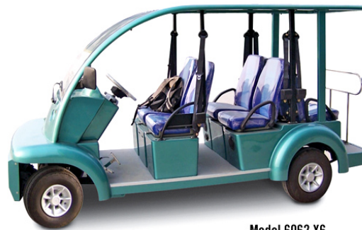
Model 6062 X6