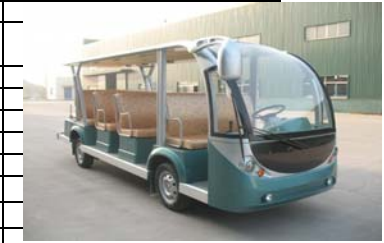
With CE certificate for EU